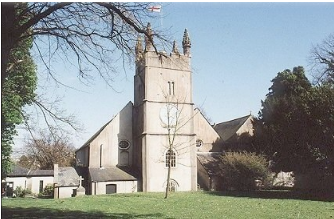
Parish Church, Stoke Damerel, Devon