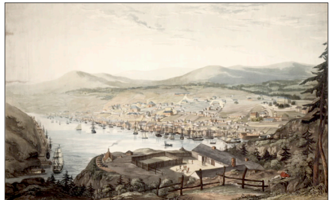
St John's, Newfoundland 1831